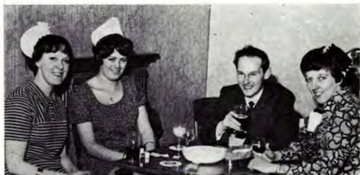
Above: He seems to be a lucky man with three ladies to be entertained.